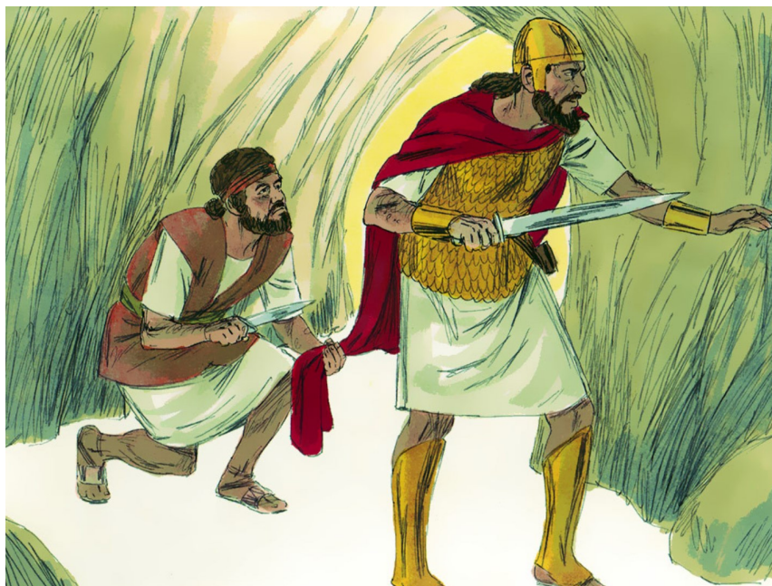
David spares King Saul's life :: David cuts the corner of Saul's robe (1 Samuel 22:1-2, 23:1 - 24:22)

Pictured: Instead of killing Saul, David cut off the edge of his robe without his noticing it.