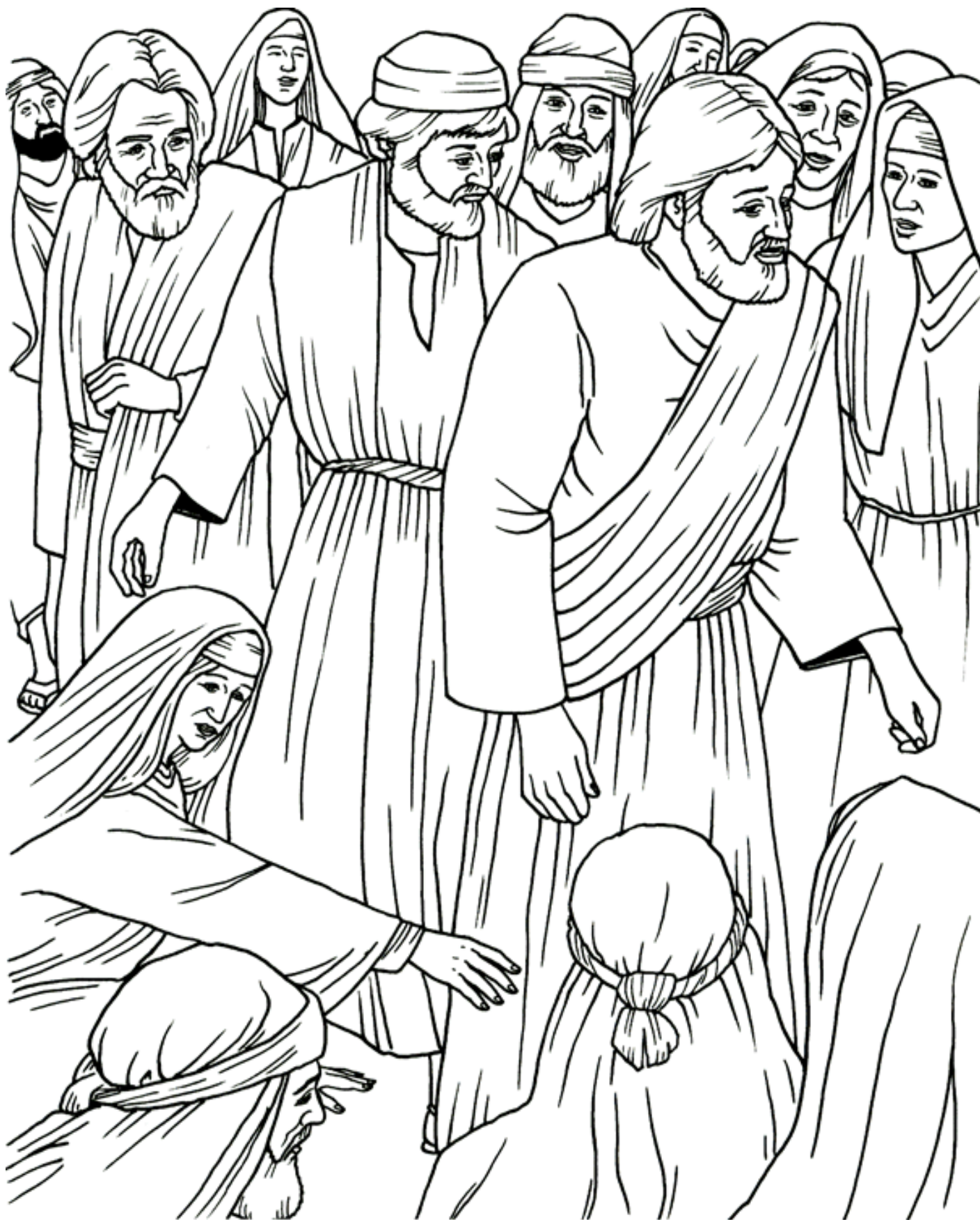
Touching the Garment Mark 5:24-34